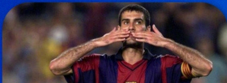
PEP GUARDIOLA FC BARCELONA